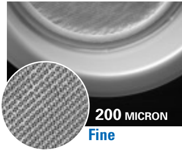
200 MICRON Fine

Available in 200, 400 or 600 micron screen