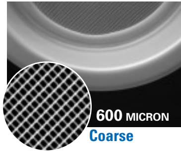
600 MICRON Coarse