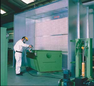
Typical three tier dry filter spraybooth

The large air openings in the filter allow high volumes of air to be exhausted without loss of efficiency as the media 'loads', resulting in a much longer life than other filter systems.