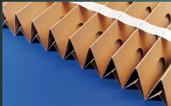
Superior quality construction with strapping to ensure correct fitting and spacing

Binks disposable spraybooth filters are stapled together during the manufacturing process and an expansion strap on the rear is provided to ensure correct spacing of 8 corrugations to every running foot (30.4cm). This guarantees optimum and superior filtering performance.